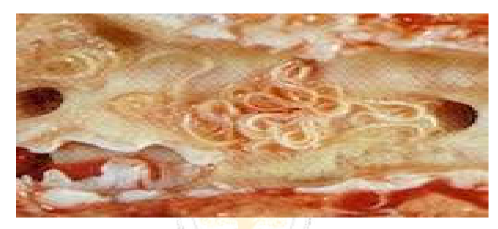
Figure 3: Adult Lungworms isolated from the respiratory tract of small ruminants by postmortem examination

Lungs infected with M. capillaris contain red, grey or green lobules 1 to 2 mm in diameter. These lesions, located in the sub-pleura of the diaphragmatic lobes, vary in consistency, number, and shape. Lung nodules as a result of M. capillaris infection have the feeling of lead shot. Infestation of goats by M. capillaris leads to a diffuse infection quite different to the nodular reaction in sheep and to the production of an interstitial pneumonia (Thomson et al. , 1988).