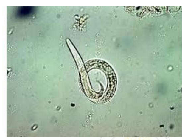
Muellerius capillaries lung worm of sheep and goats Figure 2: Species of Lungworms in Small ruminants