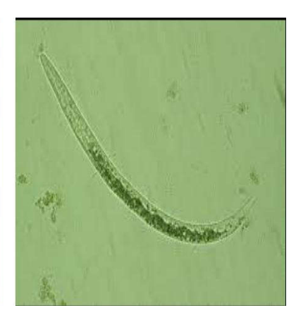
Dictyocaulus fillaria lung worm of sheep and goats