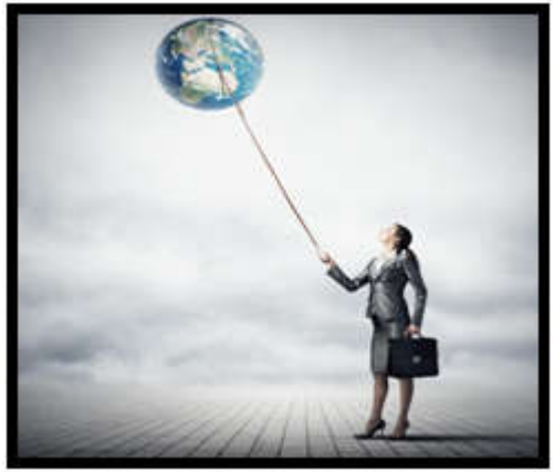
Figure 1.1: Leading in the digital age

influenced how we behave. This gap suggests that the influence of our daily digital interactions on our perceptions and decision making is significant, perhaps even dominant; yet, we still know so little about how digital technology is truly influencing human behavior. Closing this gap – understanding the role of digital technology in shaping culture and behavior and using it to an advantage –is the key to effective leadership in the future.